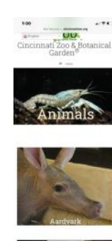
Scroll to African Lion