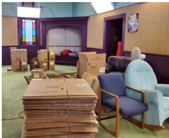
Boxes at the ready, waiting to be filled.