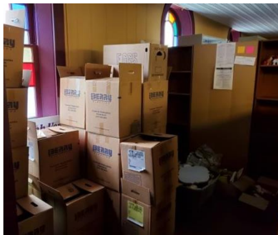
Books, books, and more books