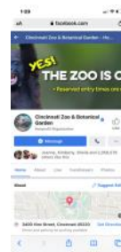
Find Zoo Link