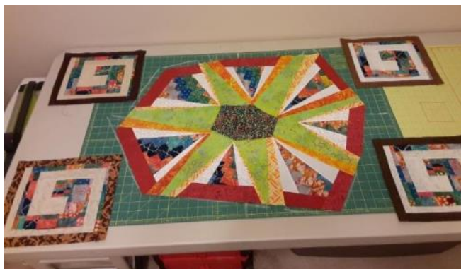
Julie's Strip Challenge

Since the total yardage of the strips equaled over 7 yards of fabric, we had a wide choice of possibilities and we took full advantage of it.