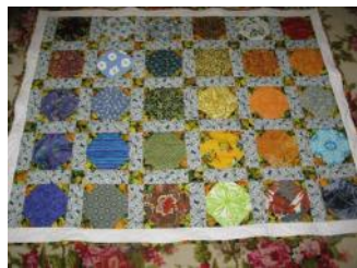
Sharon's 30 Blocks in 30 Days Challenge