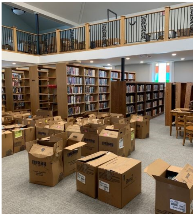
Shelves are going up, and volunteers are putting books in place.