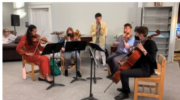
String quartet (and friend) from SUNY Fredonia provided music for the evening