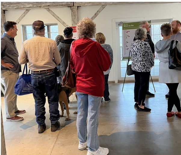
Attendees at the November 2nd meeting